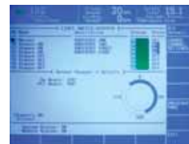
KNOCKOUT TIMING SCREEN